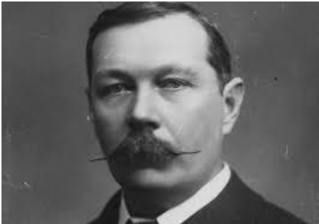
Sir Arthur Conan Doyle

Holmes was created by Sir Arthur Conan Doyle. Freemasonry was extremely popular in Victorian Britain, and Doyle was initiated into the Phoenix Lodge No. 257 of Southsea, Hampshire, in 1887. A few years later he resigned, but later rejoined. He also became an honorary member of Edinburgh Lodge (Mary's Chapel) No. 1 of Scotland. He never advanced beyond Master Mason.