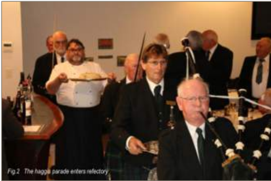
Fig.2 The haggis parade enters refectory

It was generally acknowledged that the evening demonstrates a great way