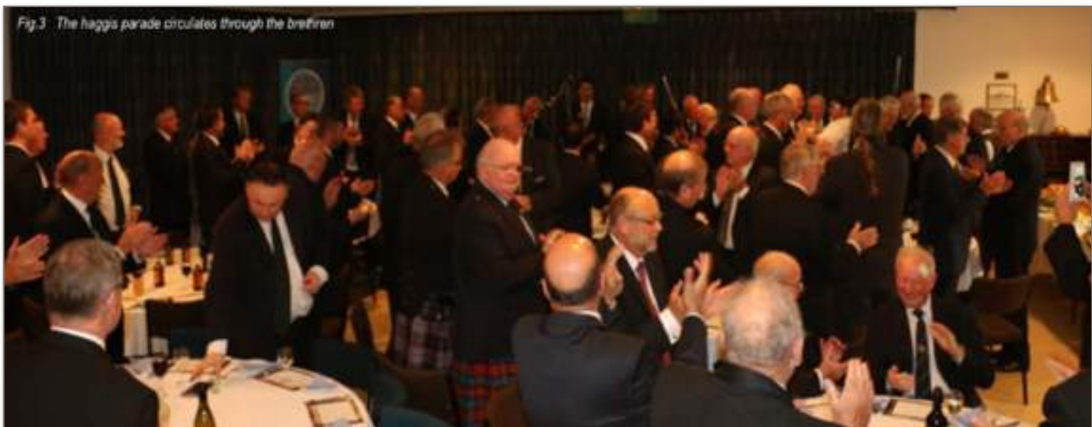
Fig.3 The haggis parade circulates through the brethren

This wonderful Scottish tradition was followed by a number of toasts between Constitutions, genuinely given and warmly received.