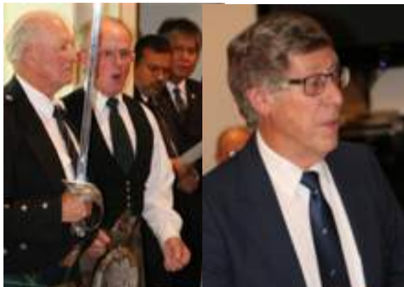
Fig. 6 The two most important requirements for Toasting the haggis.