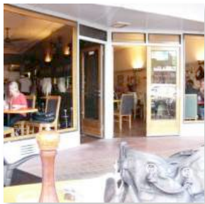
Workman's Café Bar