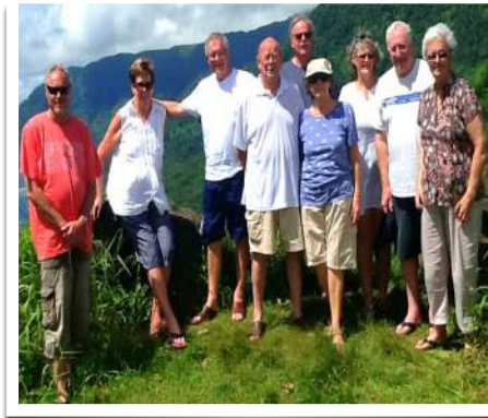
(Left) The visitors at an outlook above Apia

years ago. I can report with satisfaction it is still in good shape and being well used by the village ladies committee.