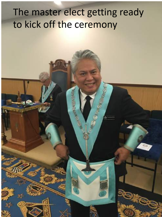
The master elect getting ready to kick off the ceremony