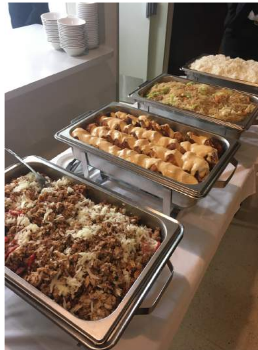
Fantastic Filipino dishes in the refractory