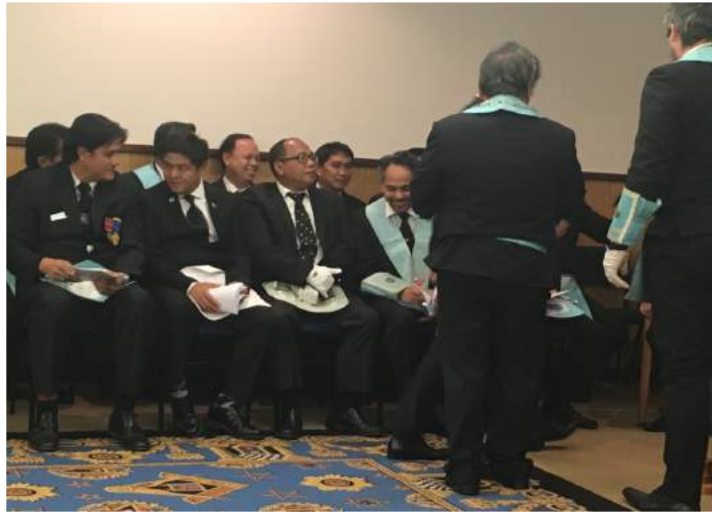
The Filipino brethren gathering to support the master elect