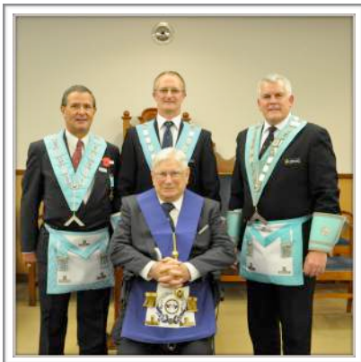
The new Master with his father-in-law and minders