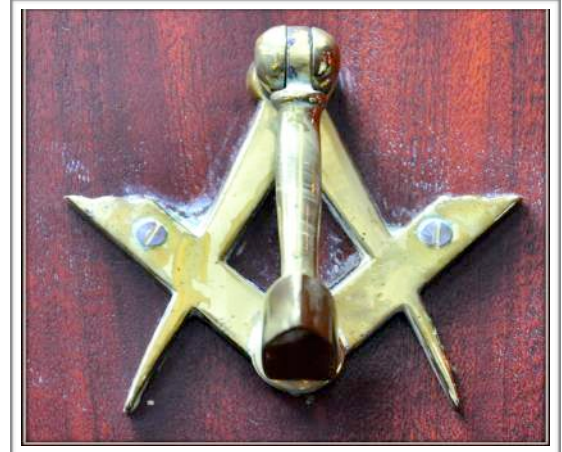
to guard our secrets from cowans