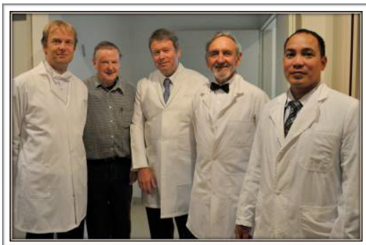
The Brothers who looked after us so well