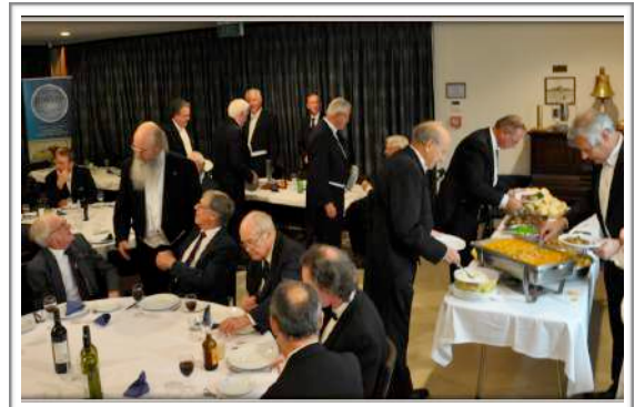
food eaten with the odd glass of wine