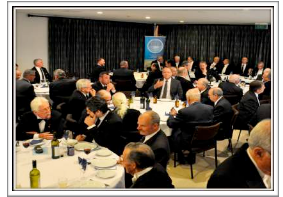
stories are recounted